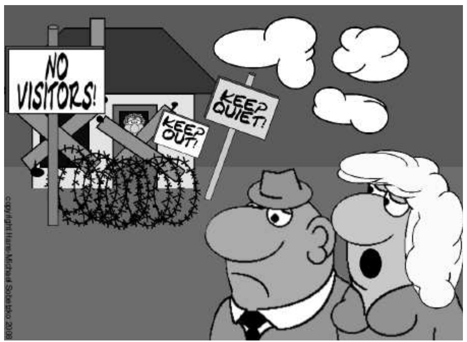
She's obviously feeling very bad today. We'd better visit her another time.

Lots of group news for this newsletter. Please pay special attention to our requests for help, and also postal votes for our EGM in September.